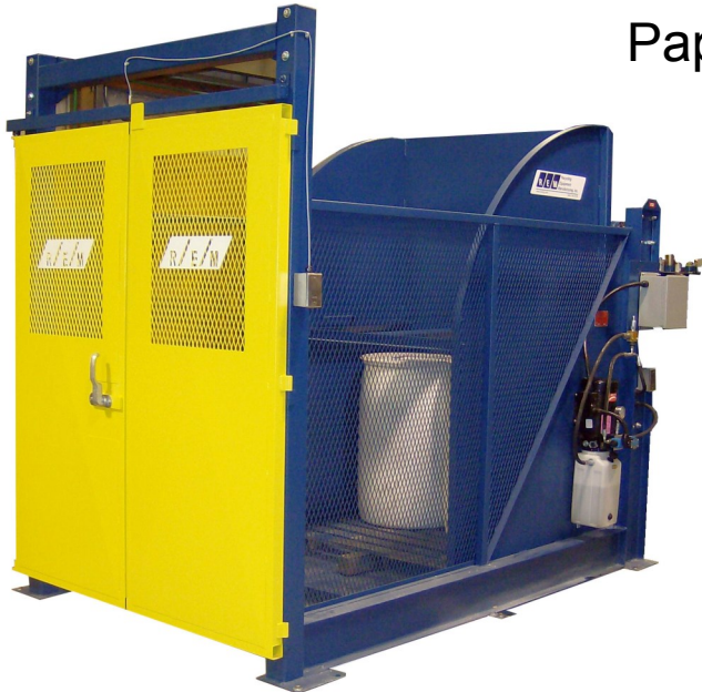
Shown with optional full safety cage